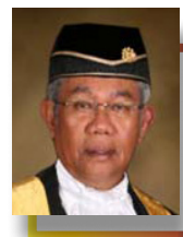
Tan Sri Dato' Seri Zulkefli Bin Ahmad Makinudin Chief Judge of Malaya

The Right Honourable Mr. Justice Tan Sri Zulkefli bin Ahmad Makinudin was born on March 28 1951 in Ipoh, Perak. He had his early education at St. Michael's Institution, Ipoh, Perak and Maktab Tentera Di-Raja, Sungai Besi, Kuala Lumpur. His Lordship then read in the University of Malaya, Kuala Lumpur and obtained Bachelor of Laws (LLB)(Hons), thereafter obtained Master of Law (LLM) at the University College, University of London. He is the current Chief Judge of The High Court in Malaya since 12 September 2011.